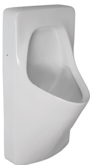
SLP 20 - ANTERO